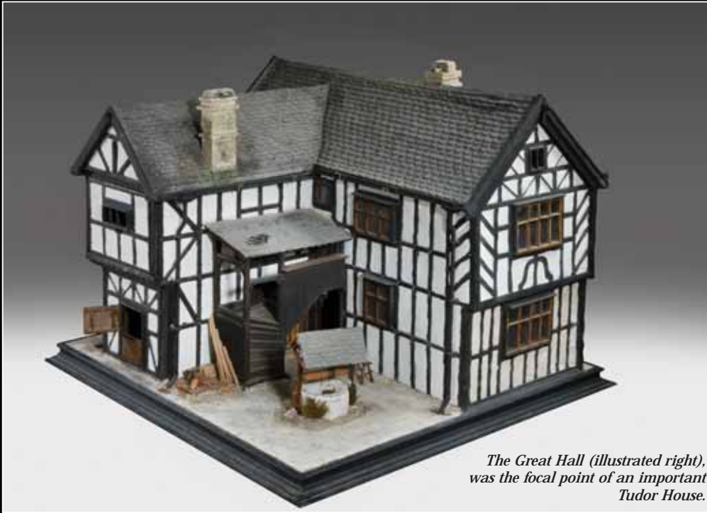
The Great Hall (illustrated right), was the focal point of an important Tudor House.

A museum quality model Tudor House that is architecturally correct throughout and that retains the original fixtures, fittings and furniture. Purchased from a private collection in the United States, with the outstanding level of detail executed in the making, it is logical to assume that this model was commissioned by a museum to illustrate an important house of the Tudor period.